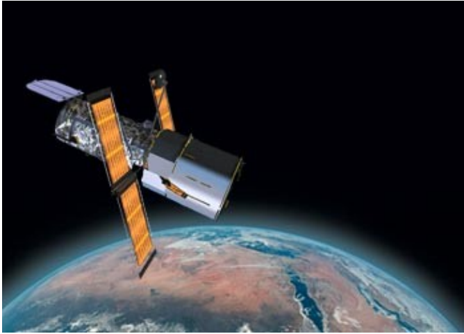
The Hubble space telescope

"We used optical images from Hubble. We were trying to pick up changes in light of a certain regular frequency, from which you can get some idea of what kind of star you're looking at, because different types of variable stars vary over longer or shorter periods. Sometimes it's to do with the size of the star and the various compositions of what kind of gas is left in there and what isn't. Radiation pressure inside the star pushes it outwards, but then gravitational collapse tends to push it inwards, and it's just a constant fight between the two of them. You can also see variation due to other factors, for example stars in a binary system, where a faint companion can block out light from a brighter star when it passes in front of it. My project found around ten variables of different types in the centre of a particular globular cluster."