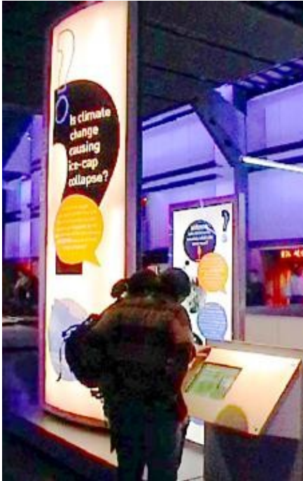
Is climate change causing ice-cap collapse? (An Antenna rapid at the Science Museum)