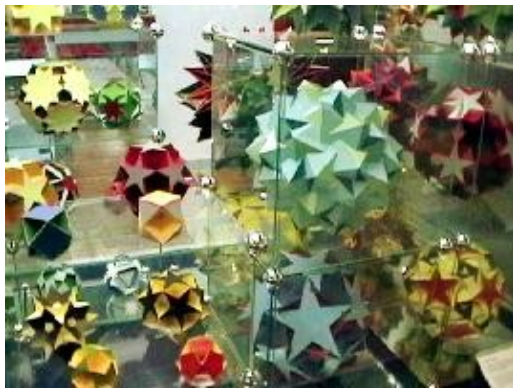
Polyhedra displayed in the maths gallery at the Science Museum