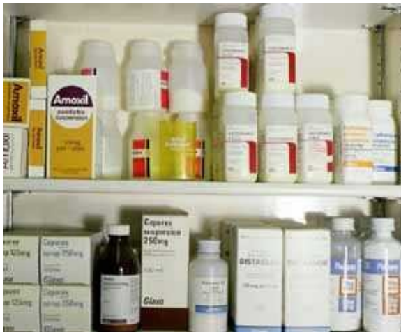
They've all been approved

The job of the MCA is to regulate medicines and to protect and promote public health within the UK. It is split into seven divisions, including the Licensing Division, which is where Rob works. It is their job to give out drug licences for products they are convinced meet the required standards for "quality, safety and efficacy", demonstrated through good manufacturing practice, good clinical practice, good laboratory practice and the clinical trials run by the companies and submitted to the MCA for assessment. Rob's colleagues in the Licensing Division have varied backgrounds in laboratories, medicine, academia, and commercial work for drug companies.