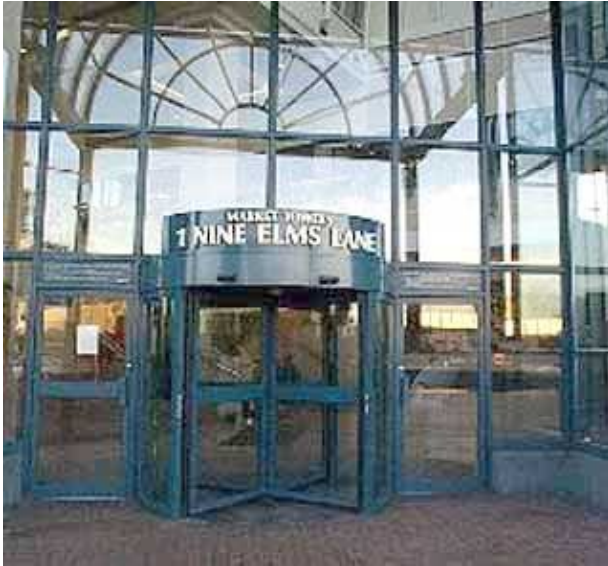
The MCA offices in London